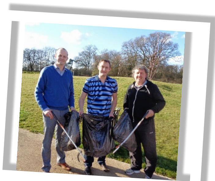
● Your Lib Dem Mile End Team in action

F ollowing many reports during the last few months, councillors have ensured the boroughs team of operatives, The Landscape Company, have cut and chopped back all hedges, trees and grass as required. If you know of any area requiring such work please do report it as the team do a great job in maintaining Mile End as a clean and green ward.